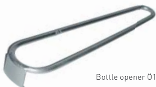
Bottle opener Ö1

Our stainless steel bottle opener makes it easier for you to remove the cap from the water bottle.