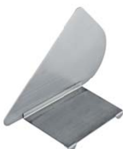
TB 2-BS divider

In order to divide the feed rack between the food and bottle.