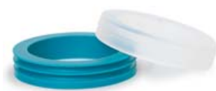
SDR 3 blue