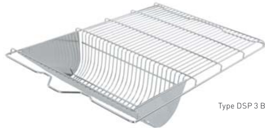
Type DSP 3 BS, 5023613