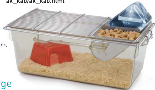
Cage type 2L with water bottle, lid and accessories

Further information is available in the brochure entitled "Cage treatment in animal husbandry" by the "AK KAB" Working Group: www.tiz-bifo.de/download/publikationen/ak_kab/ak_kab.html