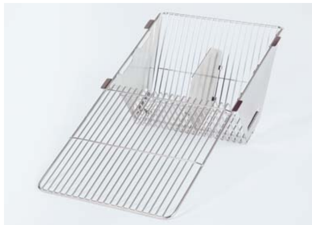
Stainless steel lid with hinged divider for 2 L type cage