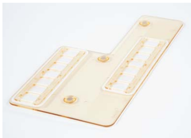
Filter level consisting of ventilation cover, holding frame and filter pad for 2 L type filter top