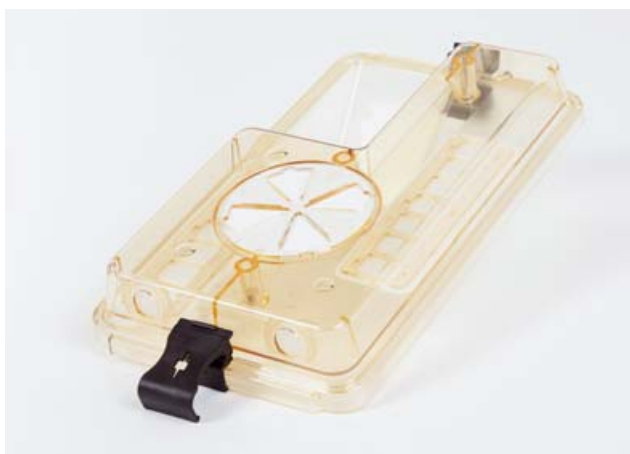
Filter top with CO 2 membrane and securing clips for 2 L type cage