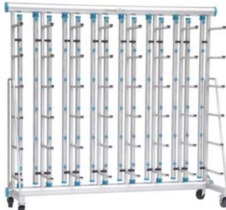
Vent LT BIO. A.S.® IVC cage rack

Vent LT BIO. A.S.® racks for IVC cages are made of stainless steel (AISI 304) and characterized by high quality and ergonomic handling. The IVC cages offer high adaptability and a wide variety of options to optimally suit your needs.