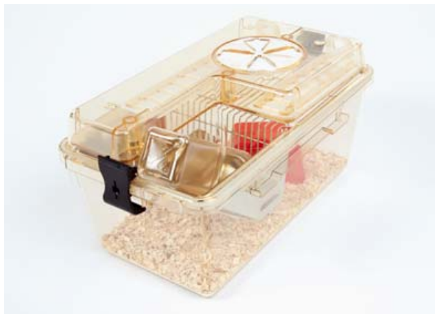
Complete IVC 2 L type cage incl. cage, stainless steel lid, filter level, filter top incl. CO 2 membrane and water bottle

ZOONLAB IVC cages offer a range of versions as well as a wide variety of options to optimally suit your needs. The entire cages made of polycarbonate are autoclavable up to max. 121°C and those manufactured using polysulfone are autoclavable up to max. 134°C.