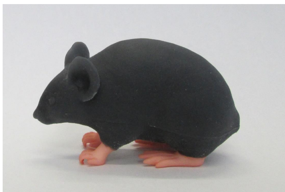
Mimicky Mouse Body