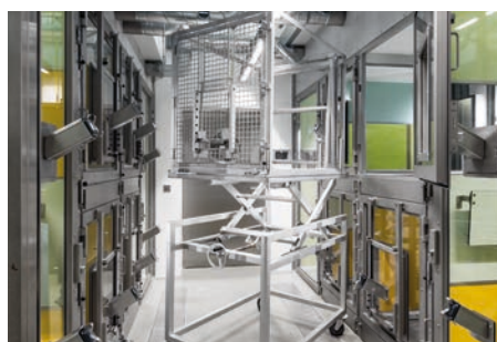
Ill. top spacious group cages Ill. middle individual interior equipment Ill. bottom mobile capturing /application cage for the transport of single animals

For the husbandry of macaques and guenons single cages with a floor area of 2m 2 and a minimum habitat height of 1.8m are needed. ZOOONLAB reviews the structural situation and designs suitable primate welfare habitats (in compliance with norm 2010/63/EU). A high variety of designs and dimensions highlight the professional realization of resting areas, window panels, climbing and sitting areas according to the current requirements. Tunnels or openings to adjacent cages create an enlargement of the habitation area. This allows a life in social groups in smaller enclosure systems.